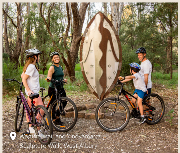
Waginta Trail and Yindyamarra Sculpture Walk, West Albury